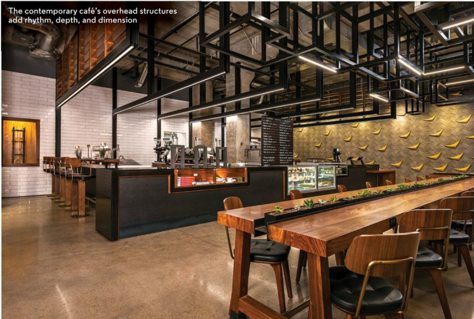
The contemporary café's overhead structures add rhythm, depth, and dimension