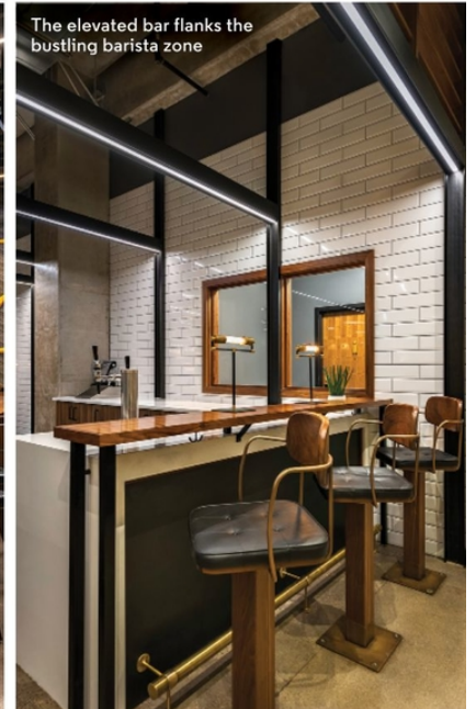
The elevated bar flanks the bustling barista zone

Sparrow Coffee in Naperville, Illinois is the brand's first retail experience. The clean lines and contemporary design create a coffee experience unlike any other. This new café, designed by blocHaus, opened in last February. Sparrow Coffee's mission for perfection partnered perfectly with blocHaus' ability to deliver a one-of-a-kind product tailored to the brand.