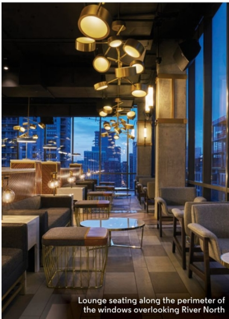
Lounge seating along the perimeter of the windows overlooking River North