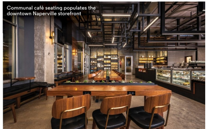
Communal café seating populates the downtown Naperville storefront

detail was also integrated into blocHaus' custom A-frame table design as a metal channel running down the center of the powered walnut tables. Suspended above the communal café seating is a massive, custom 3D cube light sculpture designed by blocHaus. The clean lines and boxy dimensions complement the long lines created by the H-beams and the geometry of the graphic concrete and wood tile within the retail space. Custom industrial T-lamps illuminate the semi-elevated walnut bar tops that flank the bustling barista zone. Inspired by Sparrow Coffee's namesake bird, blocHaus created an abstract, dimensional sparrow installation comprising handcrafted gold sparrows, which descend into the café.