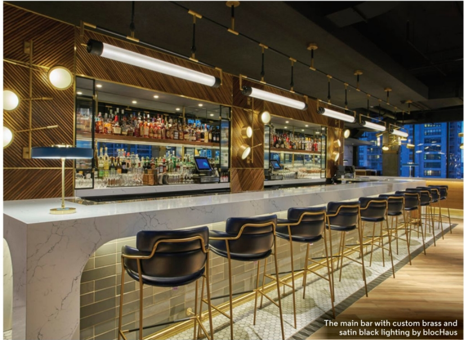
The main bar with custom brass and satin black lighting by bloCHaus

Apogee, the rooftop at the Dana Hotel & Spa, overlooks the River North neighborhood in Chicago from 26 stories up. Designed by award-winning Chicago design firm, bloCHaus, Apogee's ambiance is both sophisticated and captivating; the experience encourages social revelry at every turn. Inspired by the history of Chicago and its multitude of cultural scenes, the interior boasts fluted walnut panels and marble-clad walls, while pops of blue resemble the rich sapphire color of Lake Michigan on a beautiful, sunny day. The showstopping wall panels were constructed out of more than three miles of half-inch solid walnut strips. Custom-made vintage-inspired light fixtures and modern chandeliers are positioned throughout, reflecting the grand nature of the nighttime cityscape. Elevating the ultra-modern atmosphere, a grand bar runs through the length of space, featuring handmade tiles and gold grout. Positioned off the elevators is an intimate lounge with plush mohair sofas and custom brass partition screens, offering wide-reaching snapshots of the city.