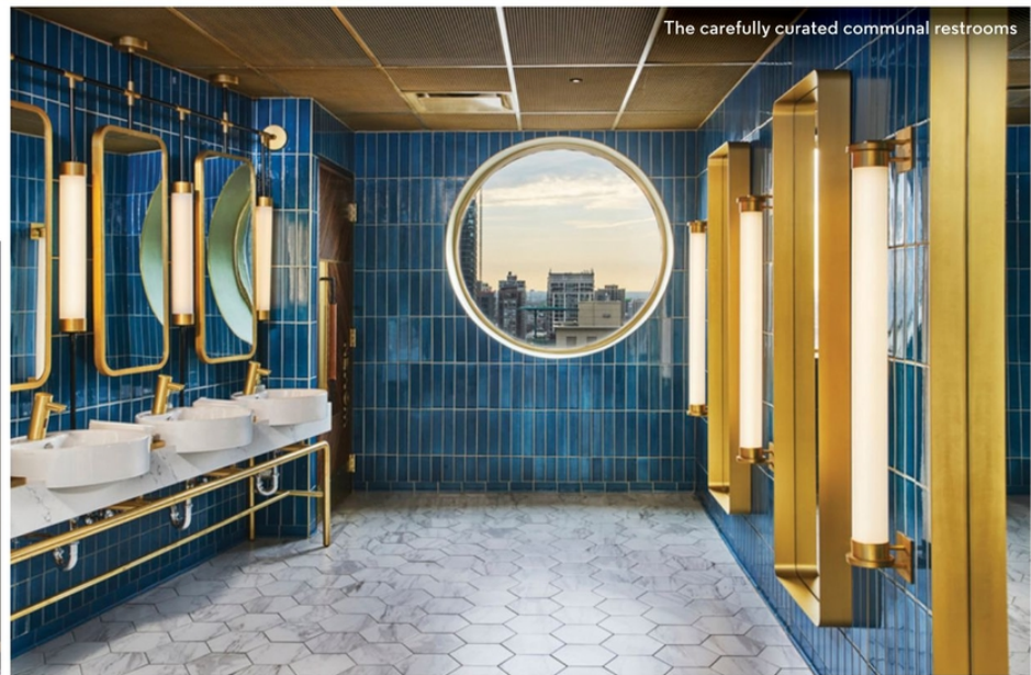
The carefully curated communal restrooms